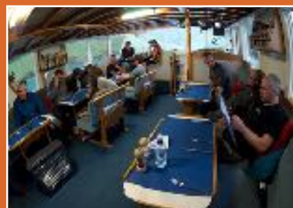
Spacious saloon and accom