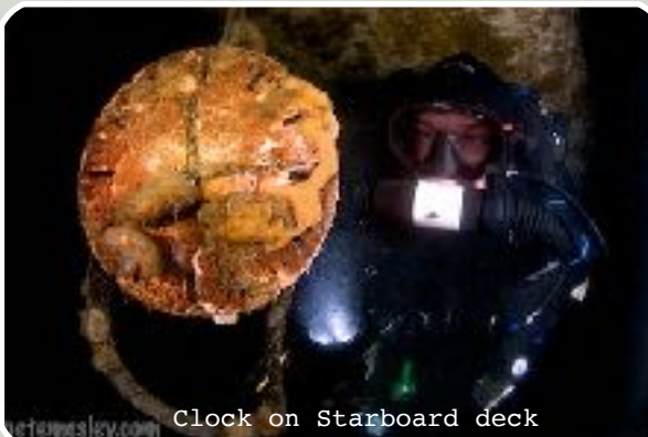
Clock on Starboard deck

The Mikhail Lermontov is a perfect wreck for all levels of wreck diver, from beginner to Advanced Wreck Penetration diver. There is something for