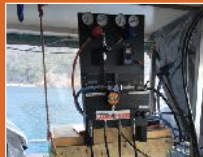
O2 Booster, compressor