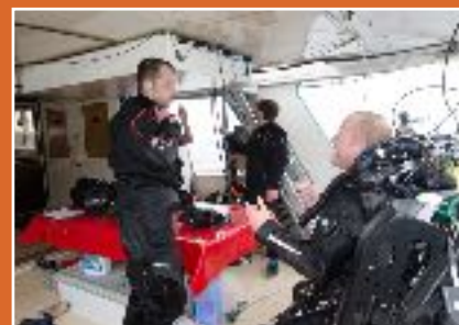
Gearing up area