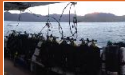
Back Deck for gear