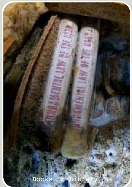
Books in Library

Your time on New Zealand's "Andrea Doria" of wreck dives will be a memorable one.